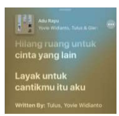
Figure 1 Figure 2 Figure 3