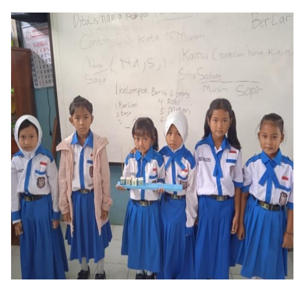
b.Going forward results playing a word from a medium-level alphabet block

a. Forward Results of playing words from medium blocks of alphabet level easily