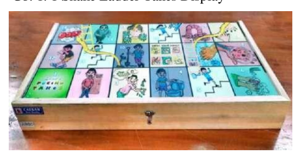
Gb. 1. 2 Snake Ladder Tahes Box