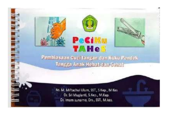
Gb. 1.3. Gudie Book Os Tahes Snake Ladder